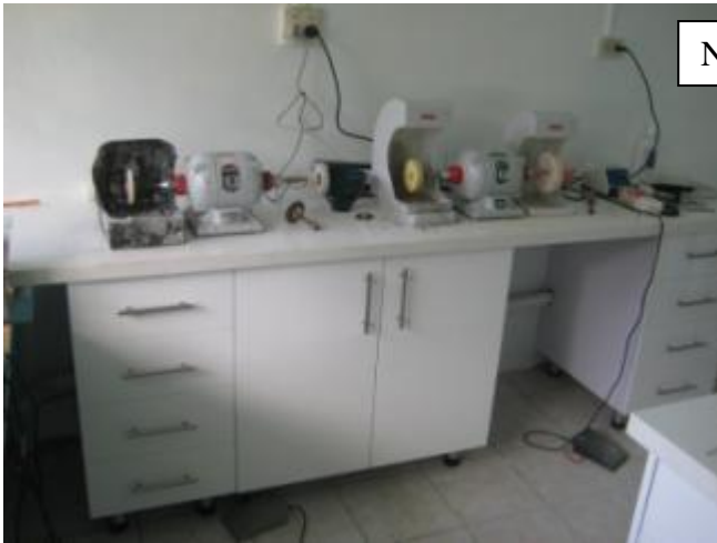
New Finished Cabinetry

Also loaded into the DIK container were donations of dental supplies and equipment, medical supplies, kitchen equipment for the Aitutaki hospital, books and computers for schools, Rotary assembled wheelchairs for handicapped children, sports uniforms for the Cook Islands athletics teams and other items. Previous visits and good communications with the Cook Islands dental department resulted in many of these items being included that had been specifically requested by the Islanders and were provided by the resources of Rotary D9780 DIK.