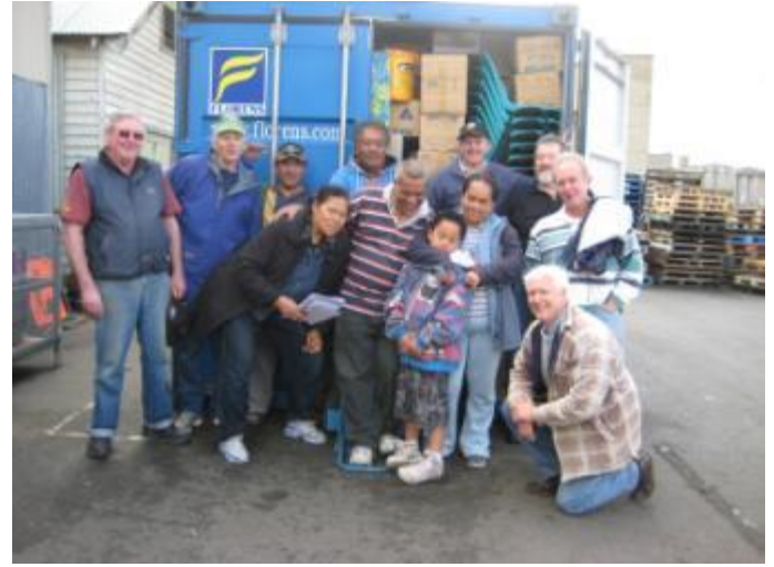
Cook Islander and Tongan volunteers helped Rotarians to pack the container in Geelong Australia

Also loaded into the DIK container were donations of dental supplies and equipment, medical supplies, kitchen equipment for the Aitutaki hospital, books and computers for schools, Rotary assembled wheelchairs for handicapped children, sports uniforms for the Cook Islands athletics teams and other items. Previous visits and good communications with the Cook Islands dental department resulted in many of these items being included that had been specifically requested by the Islanders and were provided by the resources of Rotary D9780 DIK.