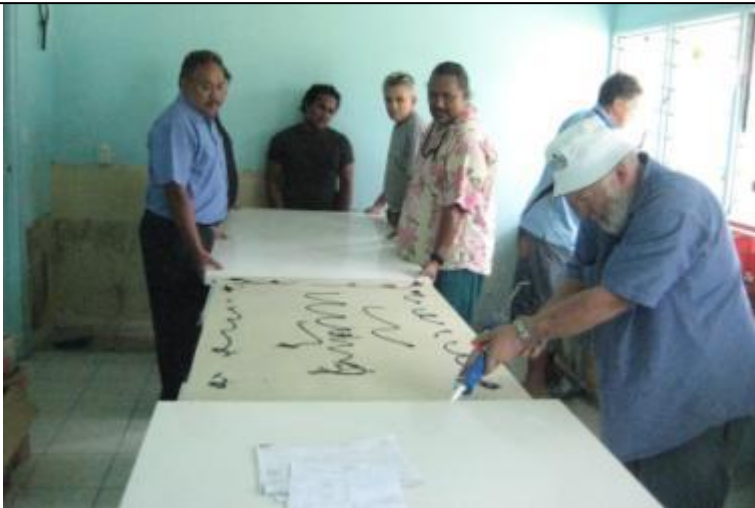
Assembling the dental cabinetry for the new Prosthetic Lab. – Rarotonga