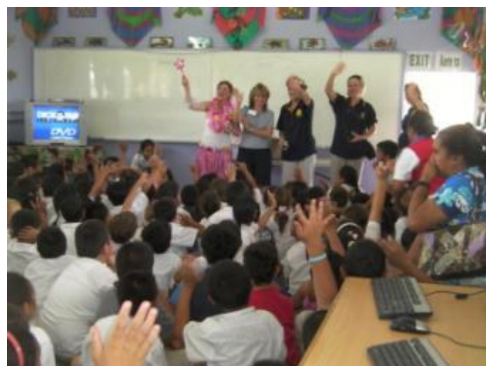
Oral Health promotion in the schools