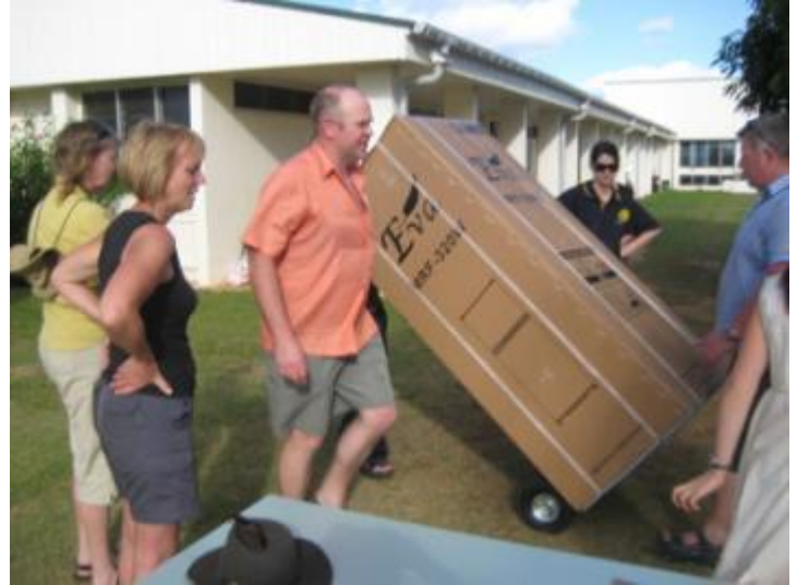
New equipment for the Aitutaki Island Hospital Kitchen